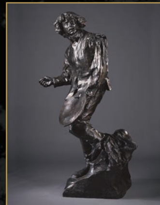
CLAUDE LORRAIN CC # 1572

Modeled 1889; Musée Rodin Bronze cast 5/8 in 1992