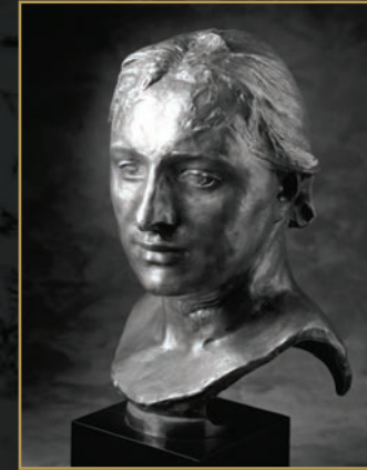
BUST OF MRS. RUSSELL CC # 1611

Modeled 1888; Musée Rodin Bronze cast 11 in 1993