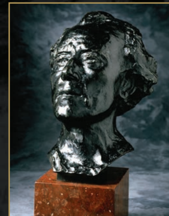
GUSTAV MAHLER (Type A) CC # 1444

Modeled 1909; cast number unknown Bronze cast before 1952